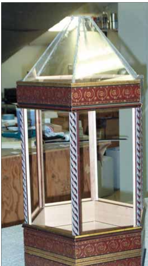
This creative framing design was inspired by Indonesian puppets brought in by a client.

Many of the projects I have done that have appeared on these pages are very complex. They frequently include oddly shaped frames and mats—sometimes requiring materials that are not readily available from picture framing suppliers. In order to make the creation of these special pieces easier, I follow a standard planning procedure: