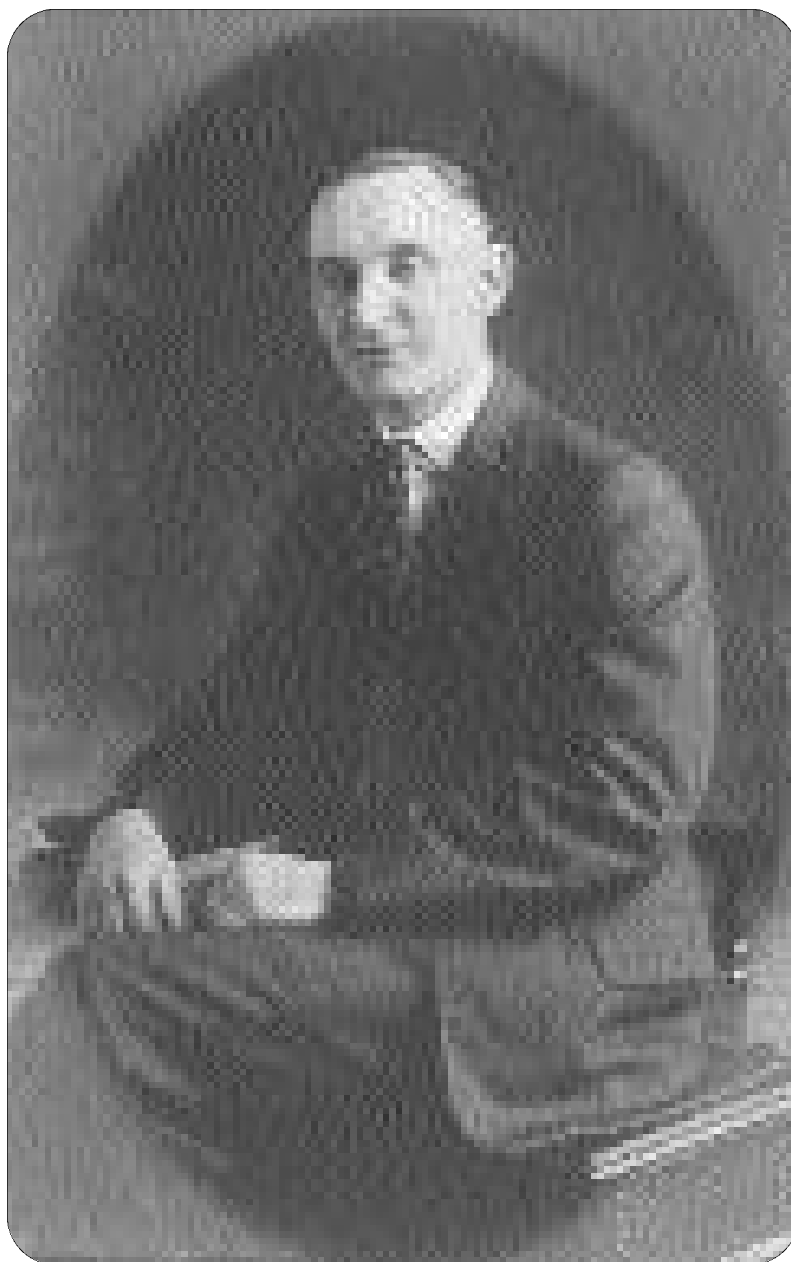
This antique photograph was ruined by damage caused by a poor quality matboard.

Maybe you have been wondering, "What about materials that are advertised as 'acid-free'? Isn't that good enough?" To be blunt about it - not for photographs. While acids in some cases can directly oxidize photographic images, for the most part they simply act as "helpers" to the more hazardous contaminants which can be found in enclosures. There have been cases of neutral and even alkaline enclosure materials causing severe damage to