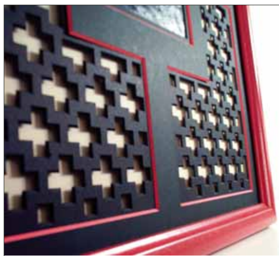
Photo 3: 3-D Latticework Detail—An angled detail of the featured design better shows the double mats that are attached then spaced away from the cream backing mat with a 1/8" foam spacer.