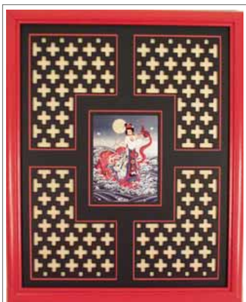
Photo 1: Asian Latticework—This latticework mat is an excellent example of using a CMC to its full potential—not only by design, but profits. (Framed artwork courtesy of Eclipse/Kaibab Industries.)

A new CMC now can be categorized in the same realm as the purchase of a large hot/cold mounting press, or an underpinner. For the first time, a mat cutter costs more than the $1,000 investment than might be made for a