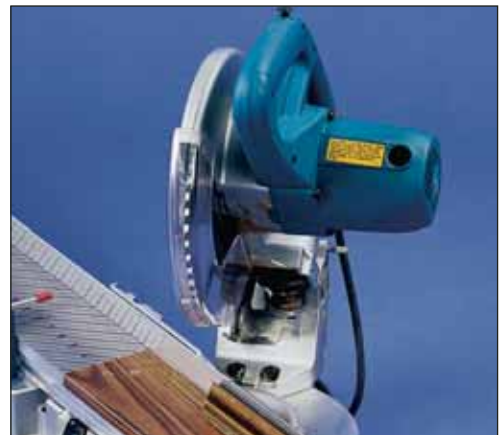
Single Miter Saw

The single miter saw provides an affordable option for cutting your own frames. Single miter saws consist of an electric chop saw, like the ones available at your local home improvement center, set to a 45° angle, and a measuring and clamping system. There are dual saw models that create a quasi-double miter saw. Although they eliminate the need to swing the blade from side