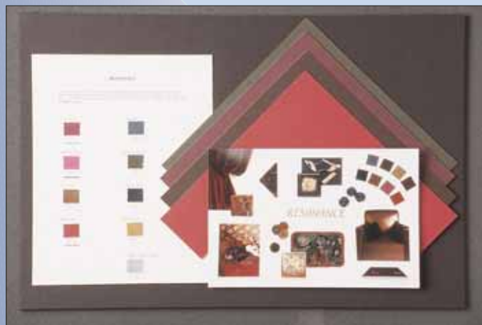
Photo 6: The colors in the Resonance palette suggest power and sophistication.