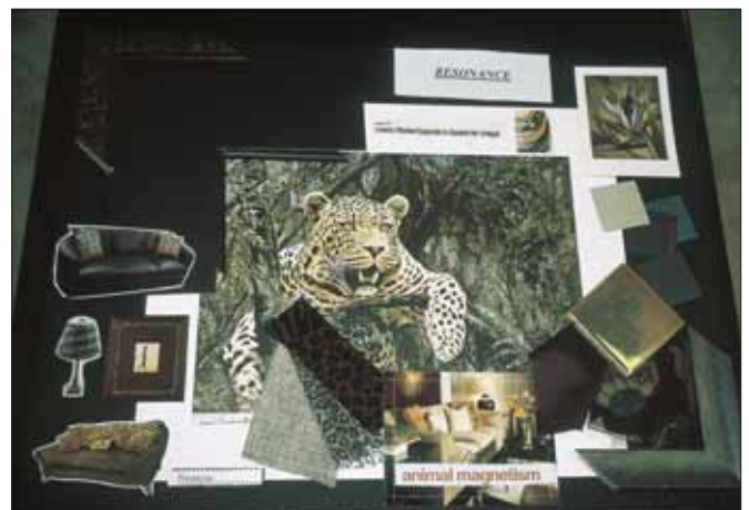
Photo 11: The colors of the Resonance palette can be integrated with global motifs, such as the popular animal prints, in frame design.