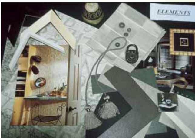
Photo 10: Achieve the classic look that so many consumers desire with the hues of the Elemental color palette.