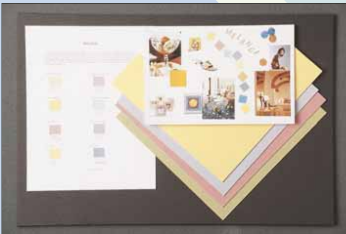
Photo 3: The Mélange color palette contains bright colors, yet less bold than the Fiesta.