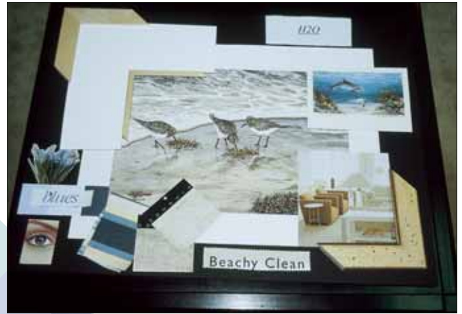
Photo 8: This storyboard represents the transitioning of the H2O color palette to framing design.

Fiesta: The next palette steps directly from fashion into home. Influenced strongly by Latin colors and the art of Francesco Clemente, this grouping highlights many shades of red, both warm and cool, accented by purple and yellow-green.