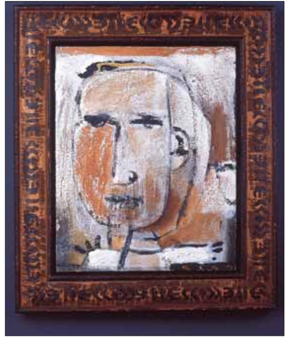
Photo 13: This design incorporates the bold characteristics of the Resonance palette.

Mélange: Transitioning down from the brights is the palette called Mélange . This is for the consumer that wants a sense of playfulness, but does not want the more vibrant shades of the fiesta palette. There are some interesting possibilities for combinations here. Look for rattan shades used with soft violet, or apricot used with