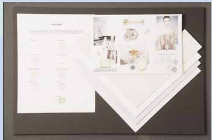
Photo 4: The Gossamer color palette incorporates pale versions of color that suggest tranquility.