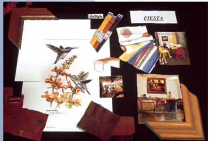
Photo 9: This storyboard using the Fiesta color palette demonstrates the vibrant designs that can be achieved.