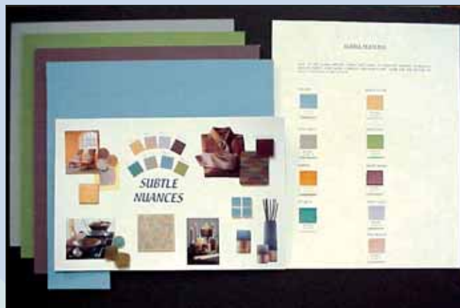
Photo 5: The Subtle Nuances color palette contains dusty and somewhat masculine colors.

After this exercise, you will have a better understanding of what is "new" and what isn't. Use this information to make a plan for updating the look of your store and what you offer in it. Here's a glimpse of what you'll find is new in color for 2001.