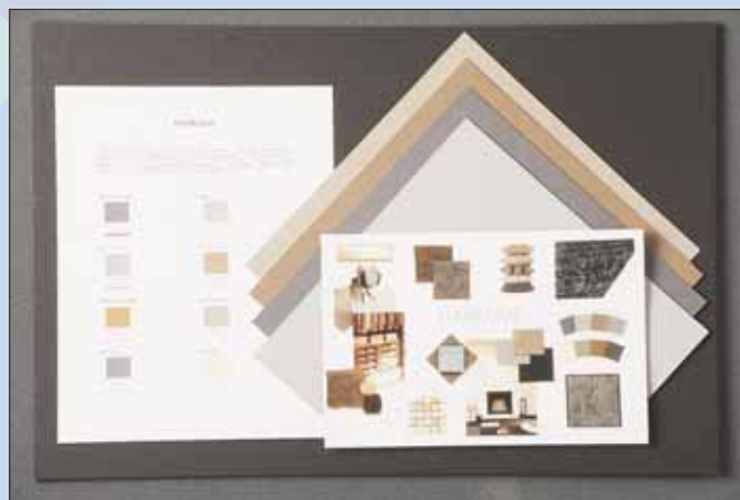
Photo 7: The Elemental color palette contains neutrals that can be mixed with the other palettes.