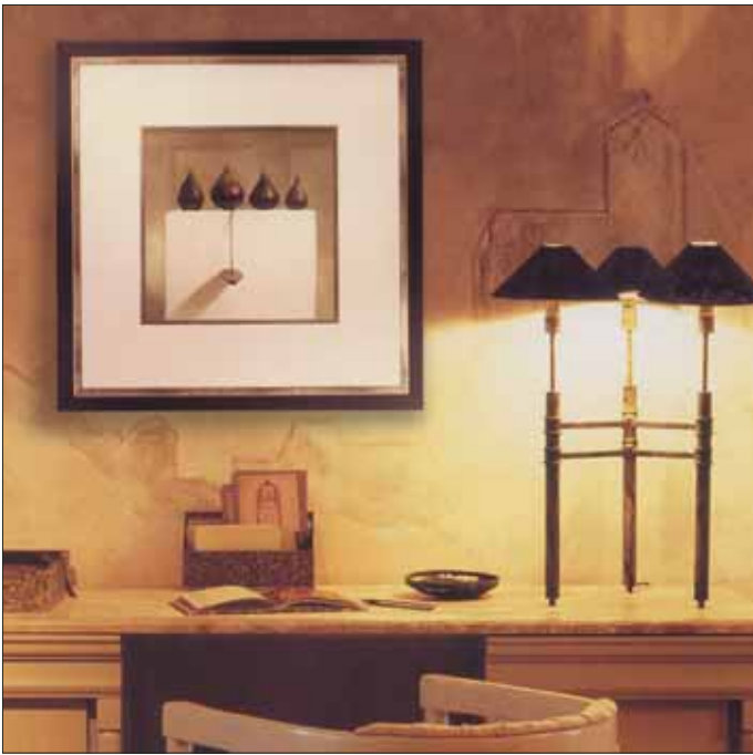
The warm, earthy yellow of this room's decor reflects the relaxed, yet bright, tones many consumers desire. The moulding shown here is Metropolitan Classics from Nurre Caxton. The deep burgundy color of the frame complements the yellow hues of its surroundings.

the color wheel is an easy swing and flows into a rich copper when expertly mixed with the tints, tones, and shades of orange. Said to be the next metal of fashion choice, copper not only gives the richness of style but also conveys a relaxed feeling. Achieve a worn and wonderful feel in an American Indian print incorporating deep beveled accents that brings the warmth of a patinated orange from the outdoors to a perfect spot in a living room.