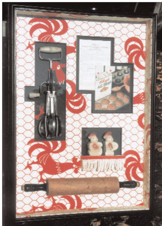
This shadowbox was designed to complement the vintage domestic items it houses.

This trusting soul allowed us free range with all design elements; we asked her for the tablecloth to use as backing, rather than a matboard we stock. The shelf