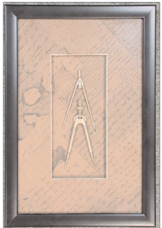
These two pieces, though designed on two different occasions, were created to be displayed together in the customer's home.