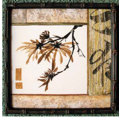
A contemporary set of Asian prints was laminated on foamboard with a new bamboo frame to complement the theme.

look of the print. We will help you choose a frame that enhances the art and follows through with its colors and theme. From antique to contemporary, every print can be made to look new with a redesigned format.