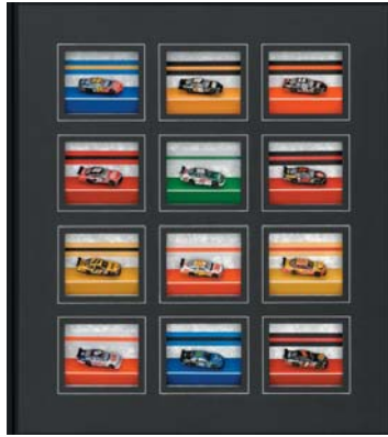
This 12-window NASCAR-themed shadowbox was designed to give the illusion that cars are racing on the track.

This Action Racing Collectibles NASCAR shadowbox is just one example of an exciting eye-catching design that is perfect for any home or office. It has 12 windows with racing car miniatures set at angles to give the illusion that they are racing on a track. The colors