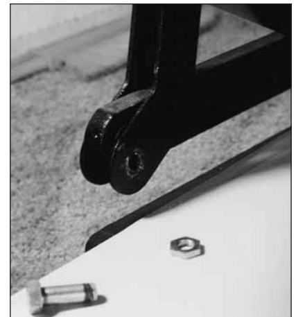
Photo 4: Remove the hex bolts and nuts on the lowest segment of the press arm mechanisms. Keep track of the order that you remove the parts so that you replace them correctly.

Make certain all parts of the mechanical press are present and in good working order (see Photo 3). There should be a 1/4" masonite panel at the bottom to smooth the surface the sponge pad sits on. The board is designed to level and smooth the base of the press. The cast metal could be uneven and that could transfer through the sponge pad to the mounting. The board is layered with a 1" soft sponge pad,