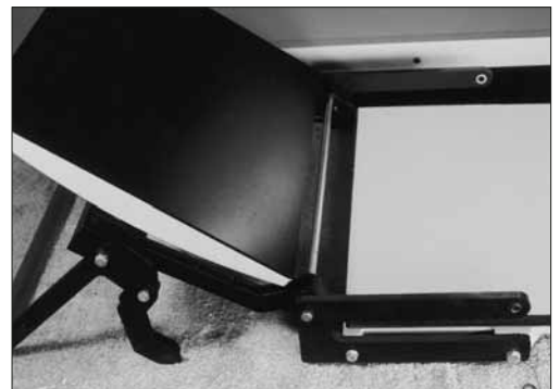
Photo 5: Once the bolts are removed, open the top of the press like a book to expose the coated platen for easy cleaning. Remember—never use anything abrasive on the surface to avoid scratching it.

heavy nature of the pad in conjunction with the toothed back of the single-sided release paper holds without much slippage (see Photo 6). A wrapped pad is not meant to be a substitute for release materials, but rather additional insurance to protect the pad if ambitious mounters