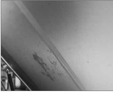
Photo 7: The long, vertical strip of adhesive residue on this platen must be removed to prevent indentations and damage to projects.