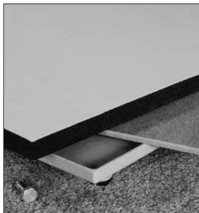
Photo 3: A healthy mechanical press consists of a 1/4" masonite base topped with a 1" soft, felt-covered foam pad. All layers must be present in order to ensure smooth, even pressure against the platen during mounting.

Properly adjusted presses (see Photo 1) will ensure proper mounting pressure, but even proper pressure can't prevent the indentation of a dirty platen (see Photo 2) into a foam board substrate. It only stands to reason that if release paper can transfer wrinkles to a mounting project, then the alien texture of adhesive residue on the platen surface of the mounting press can also transfer the same type of pattern. Although use of a release board will create a barrier between adhesive