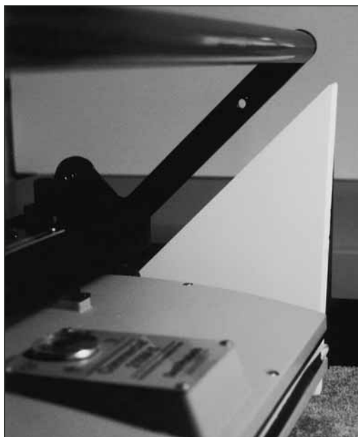
Photo 1: A softbed mechanical press should be adjusted to 45° with all layers of mounting materials placed inside. It will then apply the correct amount of pressure to mount the item. The 16"x16" square cut foam pattern is then scored diagonally to fold into an accurate 45° pattern.

It is also extremely important to constantly check the release materials throughout the course of the day. Any one project may be the culprit responsible for adhesive being left on release papers. It should be checked between jobs if over-