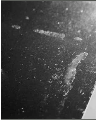
Photo 2: The press platen in this photo is just waiting to either transfer dirty adhesive or pattern indentations into an unsuspecting mounting project.

sized or premounted adhesive procedures are routinely used.