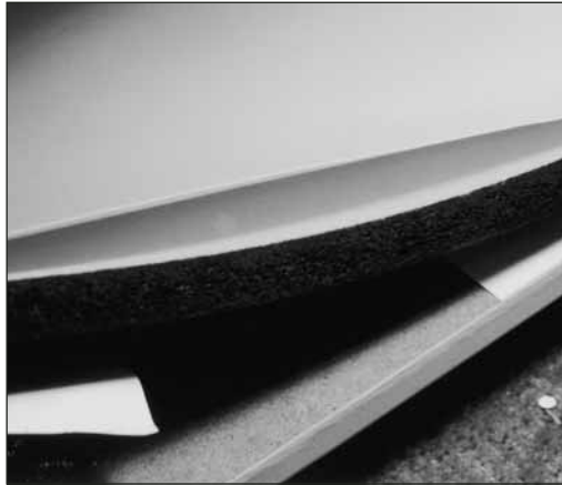
Photo 6: Wrapping the sponge pad with a sheet of single-sided release paper will better protect the sponge pad from bits of adhesive which may be exposed during mounting.

mounting substrates to press them against the heated platen or glass. They may be textured or smooth and vary between 1½" to 3" in relaxed "drop" when not in operation. Some