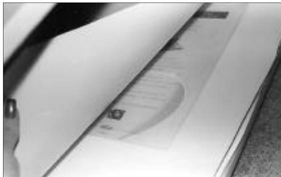
Photo 9 Polyester films were not developed for use with overlay foams when mounting.