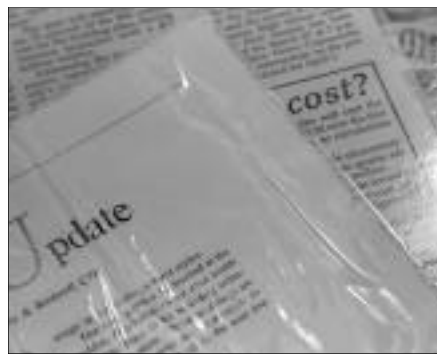
Photo 12 Curling after step one mounting can make alignment and mounting of side two very difficult.