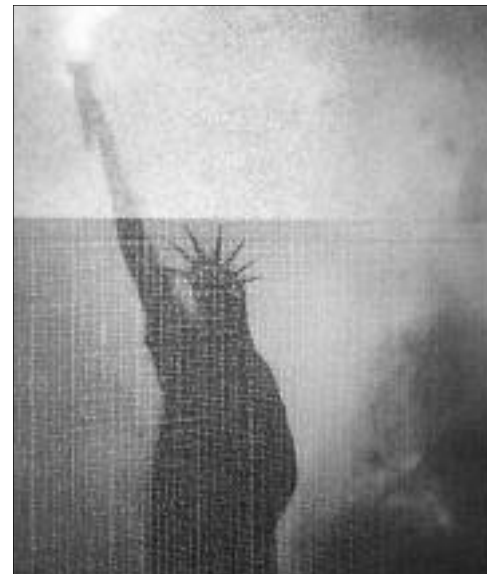
Photo 2 This photo illustrates the extremes between the unmounted vinyl films of the matte finish (top) and canvas texture (bottom) below. They are photographed unmounted for better identification between them; once mounted both are clear and more difficult to be seen in a reprinted photo.