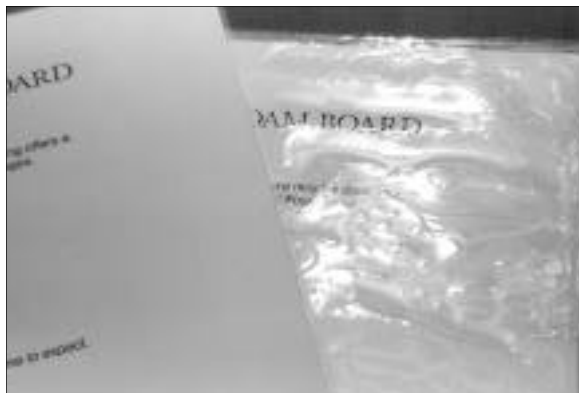
Photo 5 The left sample is a vinyl encapsulated sheet, which although more flexible appears smooth and is protected. The right sample was mounted as per manufacturer's specifications and is full of trapped air within the film. The sample was not cooled under a weight, also causing the excessive rippling of the film.