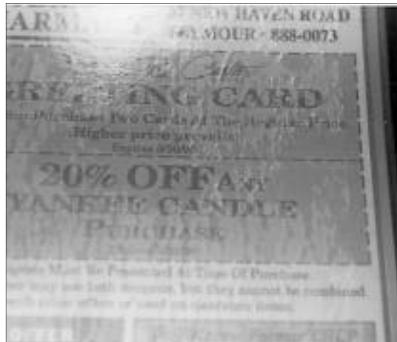
Photo 6 This is the back side of a polyester encapsulation which was pre-dried, mounted one side at a time, at proper TTPM suggestions, and cooled under a weight ...this is as good as it gets.