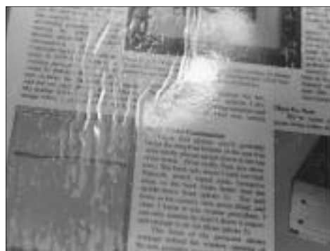
Photo 13 This is it. All the right things done, as directed...and still unacceptable. Clouded trapped tunnels of air and polyester rippling.

24x36" posters, charts, ...even Michael Jordan (if only 24" wide) which run between $1500-$2000. This service is generally found in the sign and printing market, for machines are made up to 48" wide to handle 4'x8' boards in advertising and large photo labs.