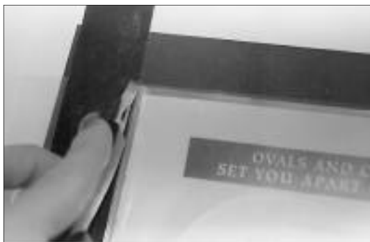
Photo 10 If attempting to encapsulate with polyester films, cut both sheets prior to mounting for exacting sizing and more control.