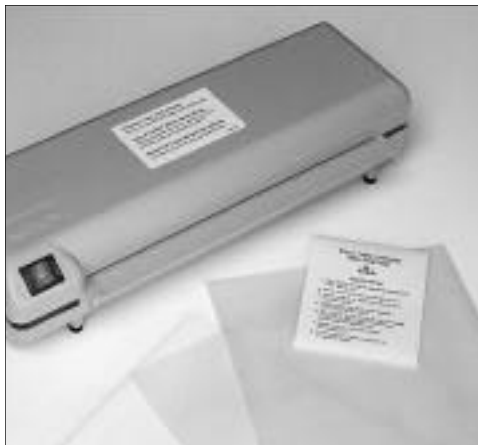
Photo 4 Commercial office laminators are manufactured by numerous different companies and are available in a variety of standard sizes. Polyester pockets of film are fed through a set of heat rollers inside a release material carrier as pictured.

Because there is no substrate, there is a tendency for the item to curl when removed from the press with only the front side laminated (photo 12), making the second step of the encapsulation even tougher; however, the alternative of mounting the two sides simultaneously almost guarantees trapped air.