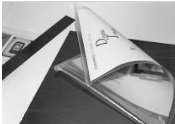
Photo 11 The front left sample was never cool beneath a weight and remains very stiffly buckled. This will never be flattened now, even with reheating. The center sample is the front side of an encapsulation of breathable newspaper, cooled under a weight. The detail at far right though cooled under a weight (as the breathable newspaper) is a non-breathable sheet and clearly illustrates trapped air even on side one.