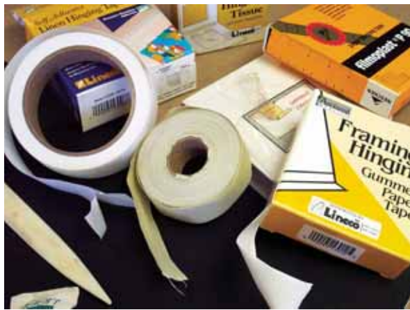
Photo 1: P-S and Gummed Tapes—Both P-S and gummed linen hinging tapes may be used for attaching window mats to the backing boards, while P-S and gummed paper tapes are designed for the hinging of art. Assorted weights and types of tapes allow for selecting the right strength for the art. (Lineco, Neschen, University Products, and Nielsen Bainbridge products are included in this photo.)

P-S adhesives are in a constant active phase, making them less stable than starch, or even gummed materials. They bond to 25% of their full capability with only thumb pressure and should be burnished