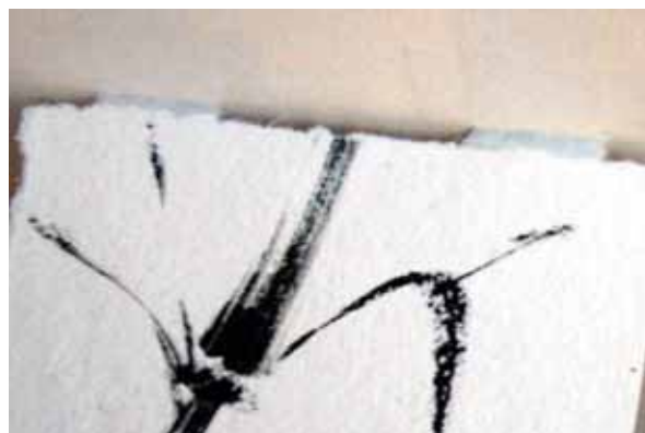
Photo 3: The T-Hinge—The basic Pendant Hinge is the vertical hinge construction. The T-Hinge is created when a horizontal component (as shown here) is added to the Pendant Hinge. This 5"x7" original art is hinged with large mulberry paper strips attached with cooked starch paste to the upper 1/8" of the back, then reinforced with a cross piece for demonstration purposes.

to be thoroughly activated. Even though acrylic-based, P-S adhesives are considered reasonably stable, slipping can occur if the hinged item is heavy, or if temperatures and humidity levels are high.