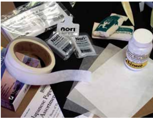
Photo 2: Vegetable Starch Materials—There are commercial gummed and pre-pasted tapes; ready to cook dry rice and wheat starches; and powders that require no cooking. Assorted papers provide choices for the correct fiber strength to allow the hinges to remain the weakest link in the hinging process. Weights, blotters, and burnishing bones are all frequently used items when traditionally hinging artwork. (Lineco, Nori, and Nielsen Bainbridge included in photo.)