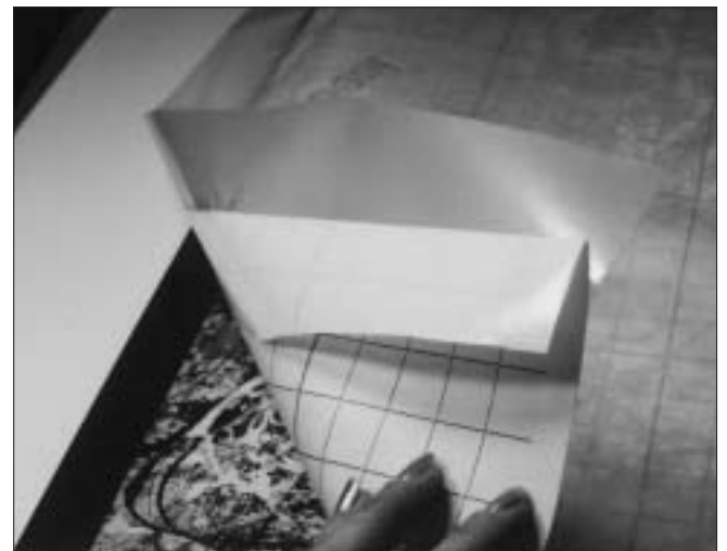
Photo 7: Once the poster has been mounted and the film cut to size, peel back the first few inches of the release paper to expose the tacky adhesive of the film for positioning on the poster.