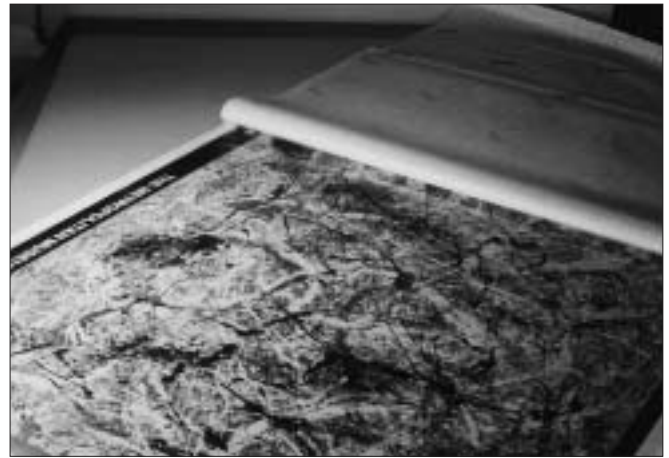
Photo 8: Pull the release liner from the tacky laminate after it has been aligned by pulling the liner from beneath the laminate and rolling it onto a small tube or PVC pipe. This prevents large sheets of release paper from flailing around and getting in the way.

Though laminating times are often suggested at five to seven minutes for a mechanical press, the most common