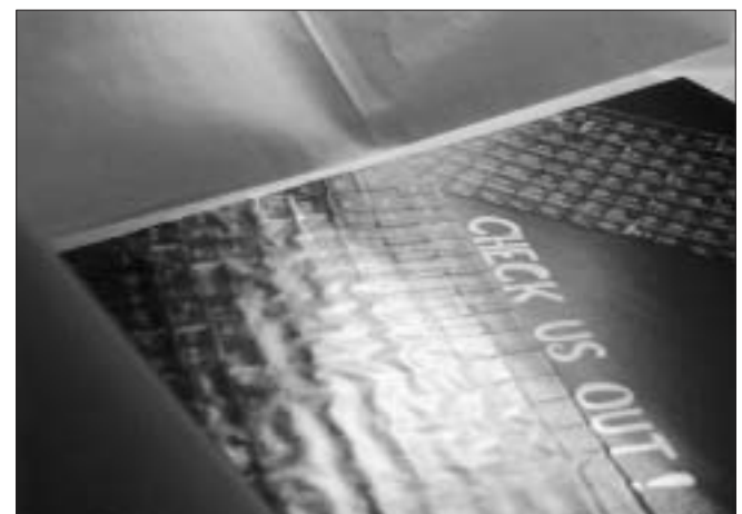
Photo 10: The left half of the project, after the first bite, shows how the laminate reacts to nearby heat by rippling. This will shrink and laminate smooth when placed into the press for the second bite. Rolling hills like this will always smooth out during bonding.