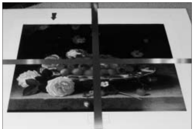
Photo 4: For a four bite image, tack where the arrow is shown. This quarter enters the press first.