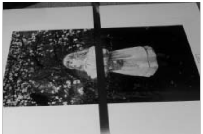
Photo 3: The arrow at left indicates the tacking point. Surface tacking rather than Z-method tacking is necessary when mounting in bites.