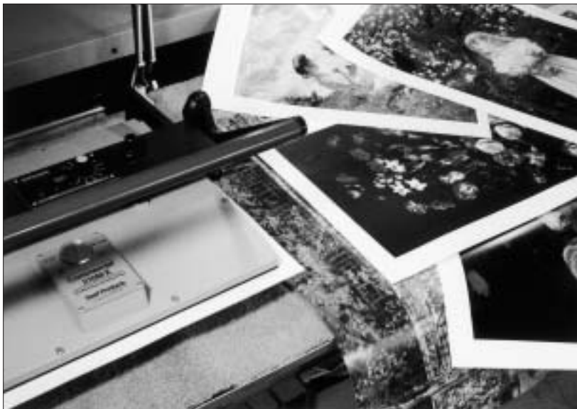
Photo 1: Mounting and laminating oversized poster art is possible, even in small mechanical presses. By mounting in bites and paying attention to TTPM, success should be inevitable.

In order to successfully achieve an oversized mounting in bites, basic rules need to be closely followed. Still, there is no reason for apprehension. By using proper time and temperature for any adhesive and laminate selected, verifying the correct pressure adjustments, and pre-drying to eliminate moisture from the artwork and substrate, you ensure that all elements of TTPM