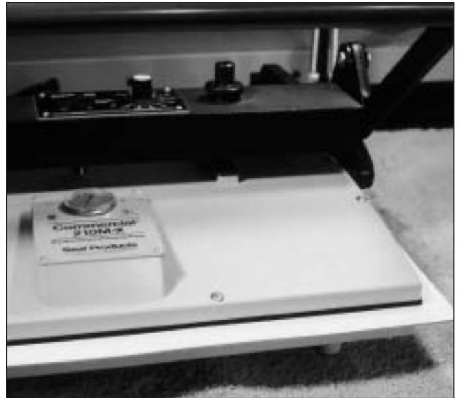
Photo 2: This 210M-X mechanical press has a release board protruding from between the platen and sponge pad. It will equalize the pressure at the bite point and protect the substrate from denting. The handle must be at a 45° angle to the table with release board and substrate inserted and resting in the closed position.

In a longer poster (i.e.: an image of Michael Jordan) still narrow enough to fit within the confines of twice the platen width, tack in the center of one of the long sides (see Photo 5). This will be fed into the press first, then directly across from the initial mounting. Then move either right or left,