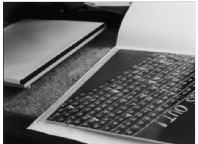
Photo 9: The right half of this laminated project for the local middle school has already been laminated using the two bite method, making it transparent. The left half is ready to be placed in the press for completion.