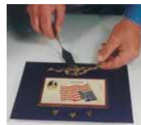
Photo 3: The compo was then applied to the mat surface and left to dry for about 30 minutes.