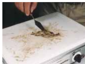
Photo 2: Composition (compo) ornaments were prepared on a steaming screen. The steam activates the glue in the compo.