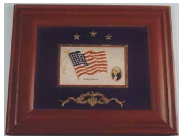
Photo 4: The compo ornaments—selected for their patriotic motifs—help to embellish the simple image.