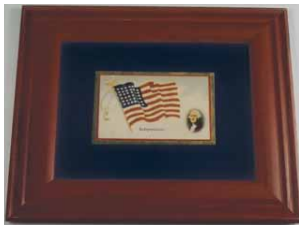
Photo 1: This artwork was nicely framed, but the designer wanted to add another element.

#2: Finish the compo to complement the moulding and/or mats you are using. Compo ornaments can be stained, painted, gilded, glazed, faux finished, or antiqued. In the