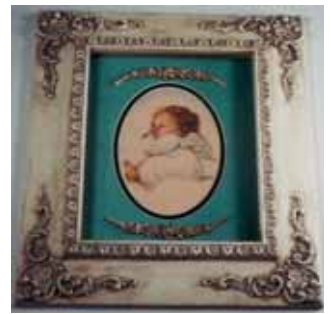
Photo 8: Shown here is another application of compo. The frame also has been adorned.

example on the opening page, the ornaments were finished with acrylic paint to match the matting elements. In the example above, the compo was finished to match the moulding.