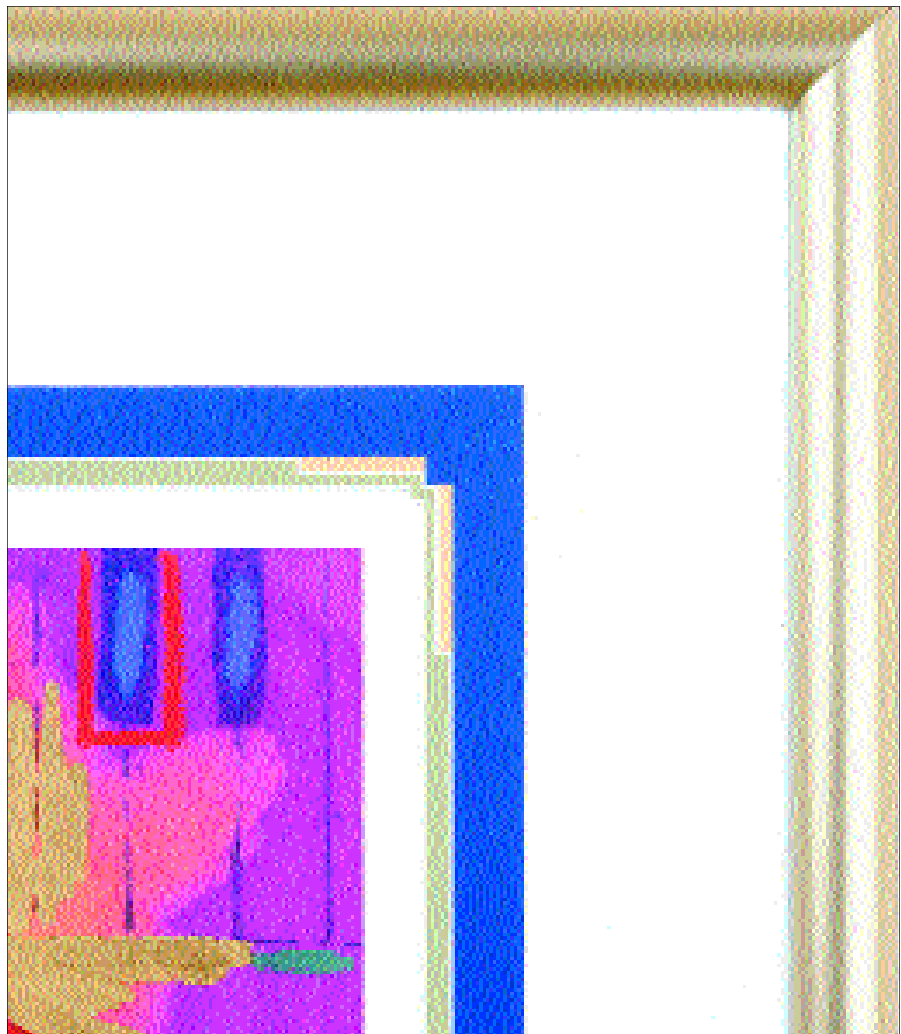
The Silver Gray and Lapis matboards create the inlay, while the Chamois Gold provides an accent. The inlay mat is then combined with the Green Pear mat and the entire combination becomes a double mat.

Step 5: Set your mat cutter guides and stops to the measurement where you want to place the inlay (using the example above, that would be at 2 1/8"). Now cut window opening of your first mat using those guides and stops.