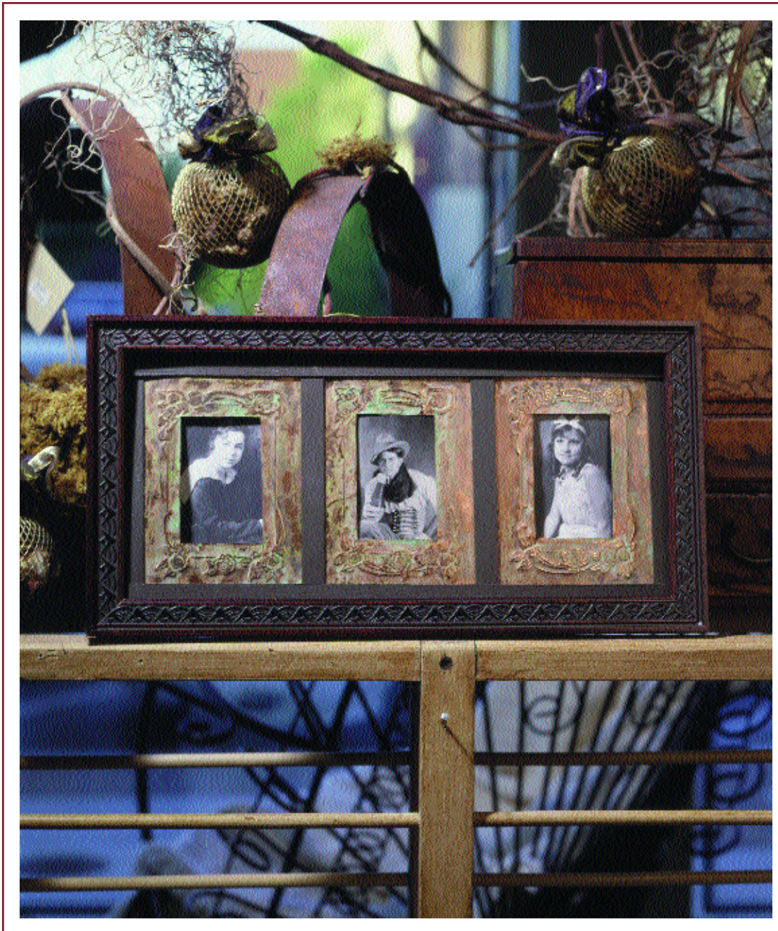
Photo 1: These aged copper mats were created with just a few easily available items.

Editor's note: The instructions for these projects are taken from the book "Frame It" by the Vanessa Ann Collection. This hard cover book, published by Merideth Press, includes over 50 frame design ideas.