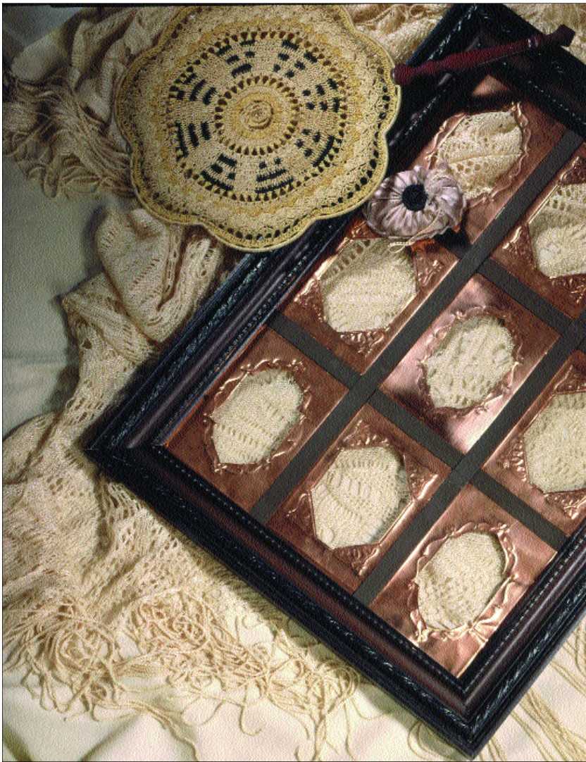
Photo 2: These copper mats were not aged and were created with a different weight copper sheet.

not antiqued (photo 2) were made with 36 gauge copper instead of 18 gauge.